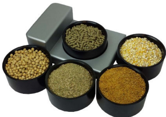
QuasIR™ 3000 Sample Spinner and Cups