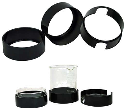
Holders for Sample Spinner