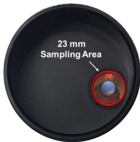
QuasIR™ 3000 Competitor